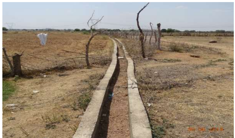
Field Channel of Pathapur minor L4